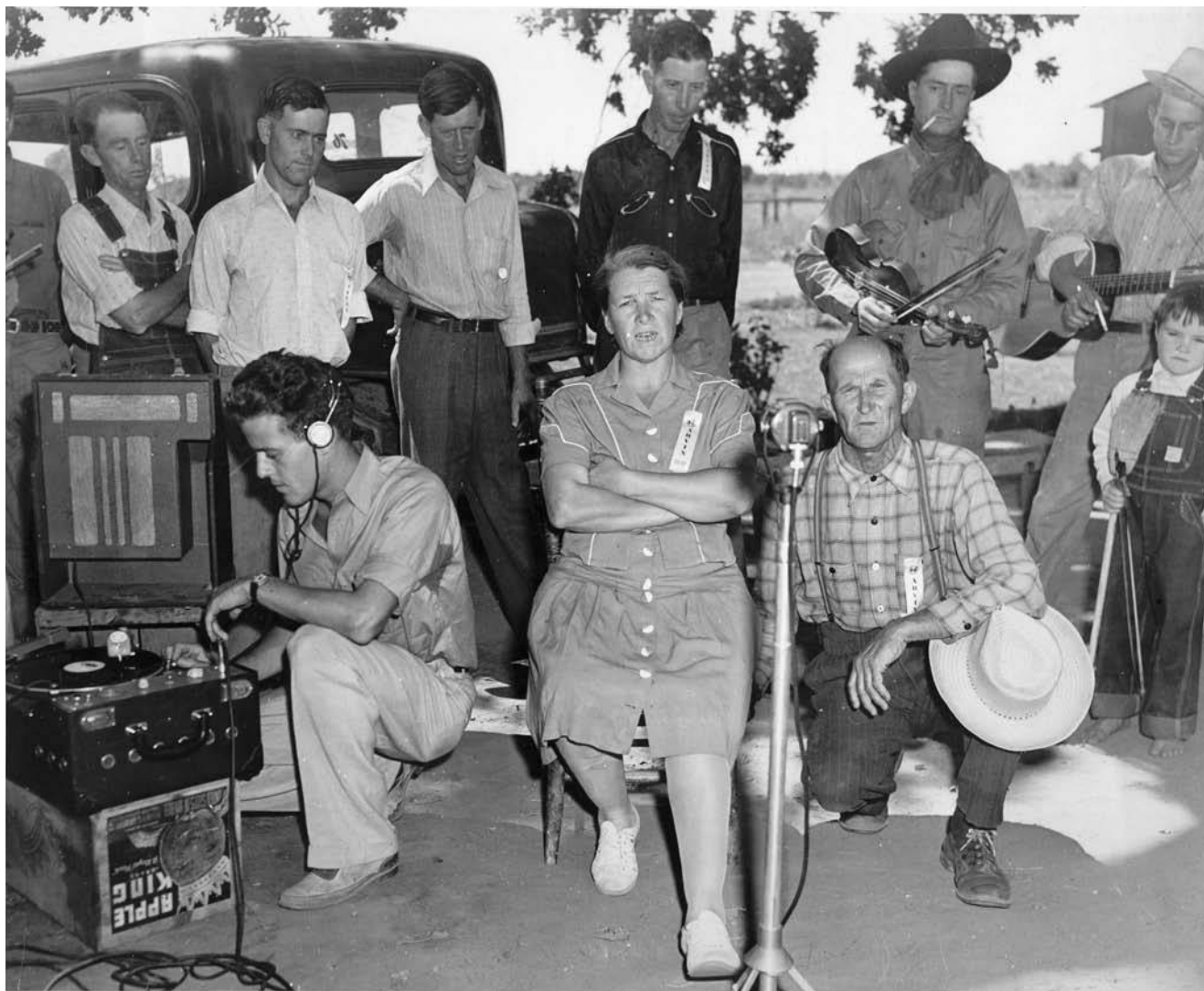
Music is a vital part of daily life to this migrant family camped out in California's Central Valley during the Great Depression.