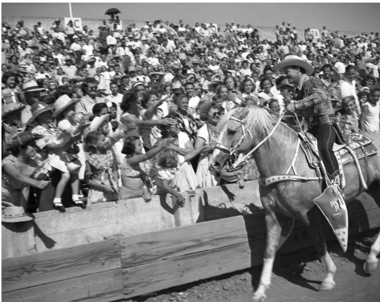
King of the Cowboys Roy Rogers, one of America's favorite Western singers, and founder of the group Sons of the Pioneers, wows the crowd at the California State Fair in the 1950s.

Big Rock Candy Mountain was, in some sense, California itself.